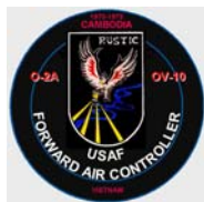
Rustic patch