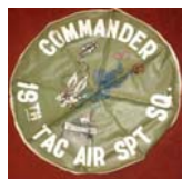
Tire cover

Your editor can vouch for these men's outstanding contribution, from his 30 days TDY in August, 1970 as a Rustic. They went from wide-eyed passengers who barely knew a bomb from a rocket to full FAC participants in an incredibly short time. They were invaluable to the Rustics. Note that Jerry Dufresne's name was selected to represent all of them on the rear canopy rail of the OBA's Bronco in Fort Worth. (page 5 and Jerry's picture page 3)